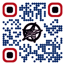
Mark S. Earley Supervisor of Elections – Leon County, Florida

Visit LeonVotes.gov to view your voter info, see your sample ballot, locate your Election Day polling place, check Early Voting schedules and locations, or request a Vote-by-Mail ballot!